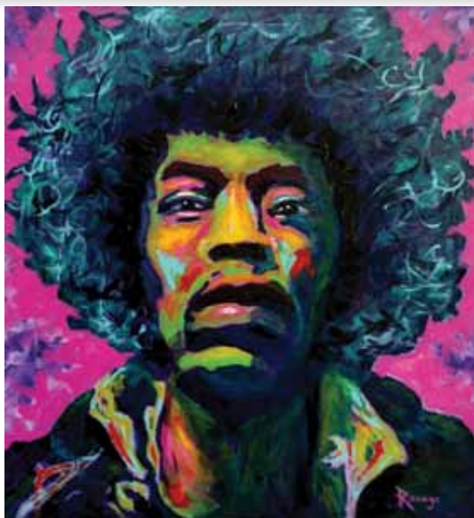
"Jimi," by Bernie Rosage, is at Fine Art at Baxters Jan. 13-Feb. 6

Selections from England, Scotland, Ireland and Wales, whose traditions of celebration and gifts on or about January 6 date back to the 16th century, when controversy over adoption of the "new" Gregorian calendar erupted across western Europe. The program then offers celebratory carols in a blend of pagan Saturnalia, more generally pantheistic traditions, and Christian tradition, and concludes with an audience sing-along.