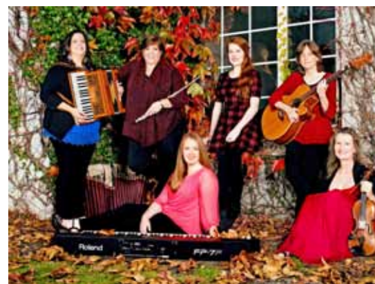
Cherish the Ladies performs Feb. 21 at Grover C. Fields.

Based on the First World War memoir by Vera Britain, the story depicts the innocence of youth, love and dreams that are tragically thrown into the reality of war.