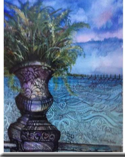
Left: "Shell" Right: "On the Neuse"

Come to Downtown New Bern's ArtWalks! 5-8 p.m. Friday, January 13 and February 10