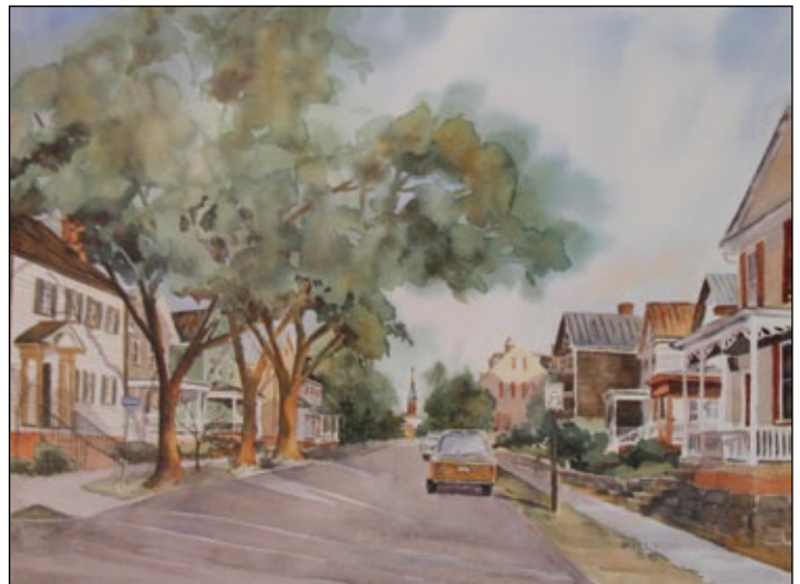
"POLLOCK STREET, NEW BERN, N.C."

boards or what have you. To me, representative art can be applied as expressionistic as well as impressionistic."