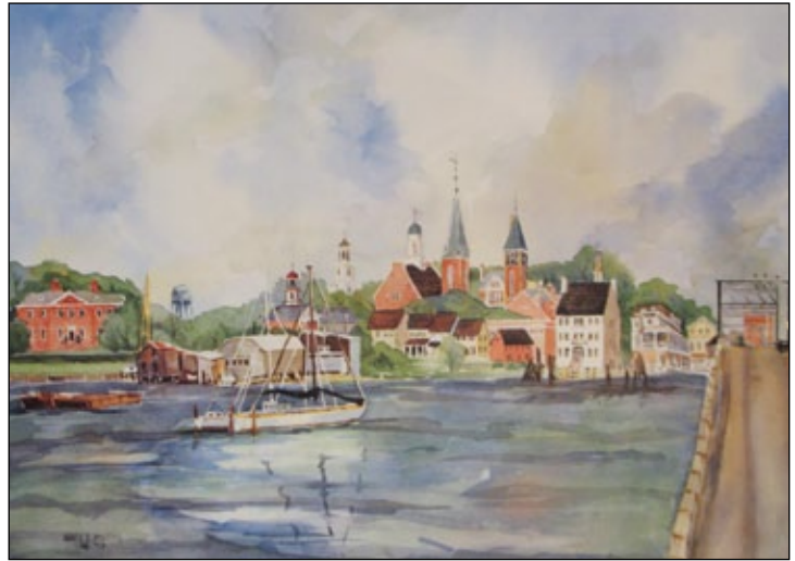
"TRENT RIVER WATERFRONT"

"Being a realist, I find it is fascinating to use the fluidity and transparency of watercolors to record something that I have found beautiful – whether it be a portrait, landscape or activity. It is exciting to see what happens when water-based colors are applied to a surface, whether it be paper, canvas